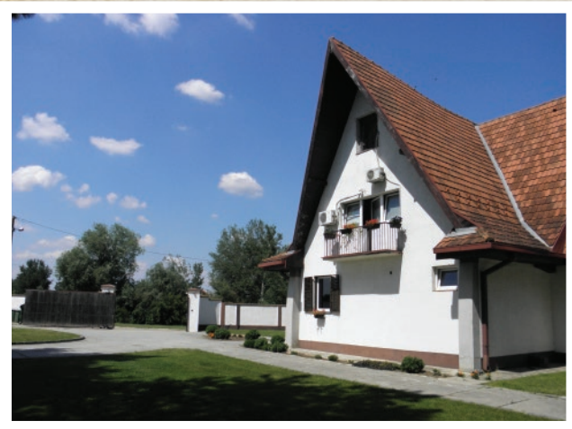
From top: Shepherds and their sheep are features of the Serbian countryside; Small villages are common outside of Belgrade; Steve teaches at the HUB, a Bible school.